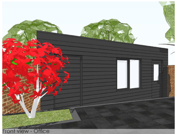
Front view - Office

Office address: Delfseplein 36 | unit 1.03 3013AA Rotterdam The Netherlands