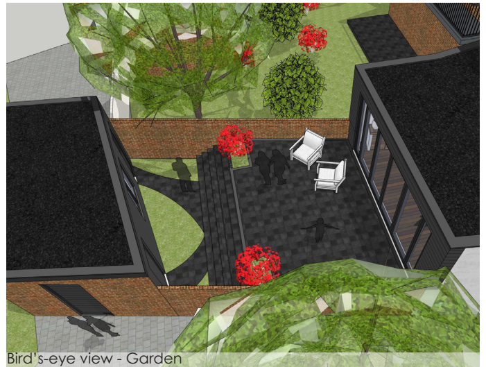
Bird's-eye view - Garden