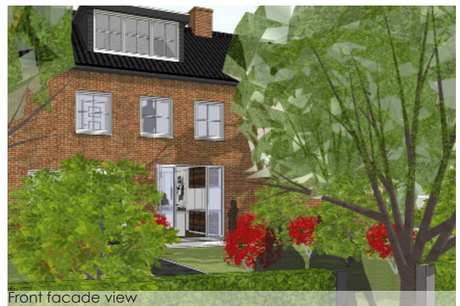
Front facade view

Office address: Delfseplein 36 | unit 1.03 3013AA Rotterdam The Netherlands