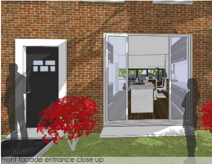
Front facade entrance close up