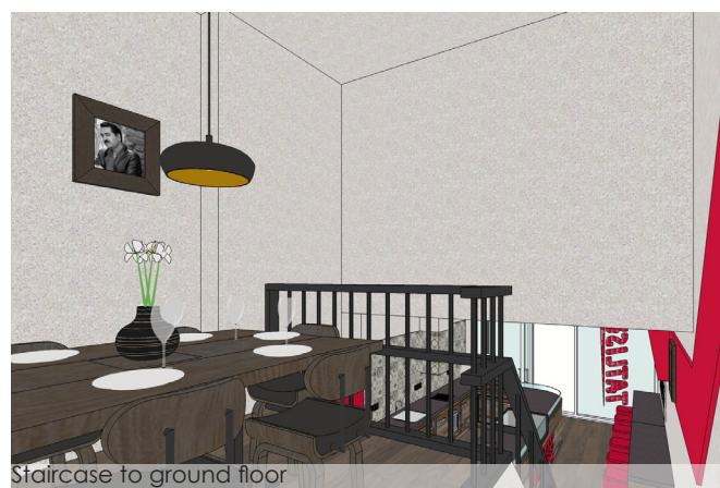
Staircase to ground floor

Office address: Delfseplein 36 | unit 1.03 3013AA Rotterdam The Netherlands