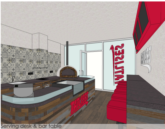
Serving desk & bar table