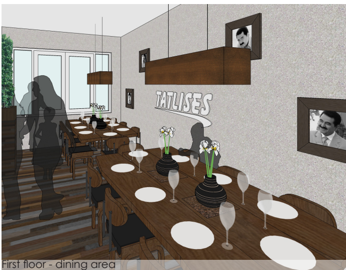
First floor - dining area