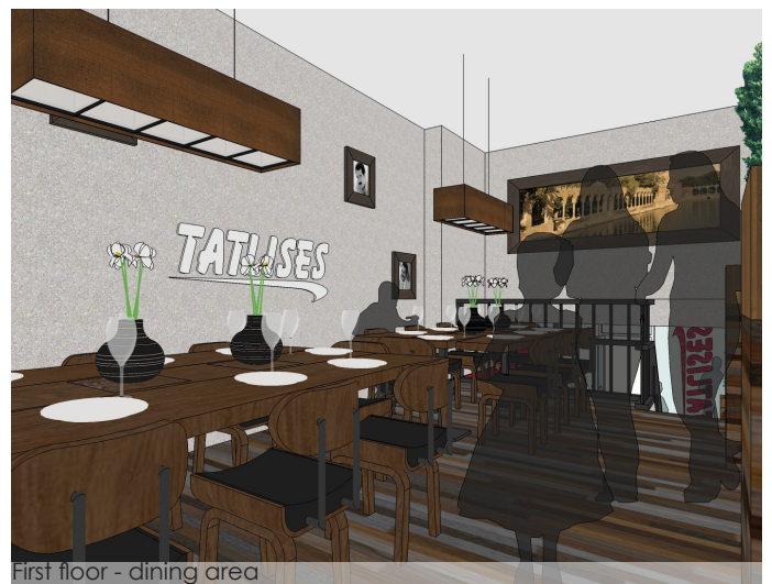
First floor - dining area

Office address: Delfseplein 36 | unit 1.03 3013AA Rotterdam The Netherlands