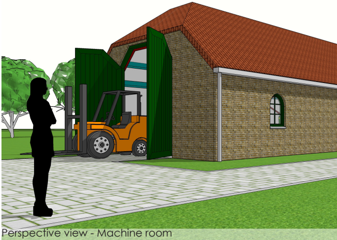
Perspective view - Machine room