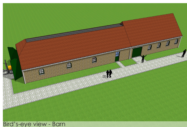
Bird's-eye view - Barn

Office address: Delfseplein 36 | unit 1.03 3013AA Rotterdam The Netherlands