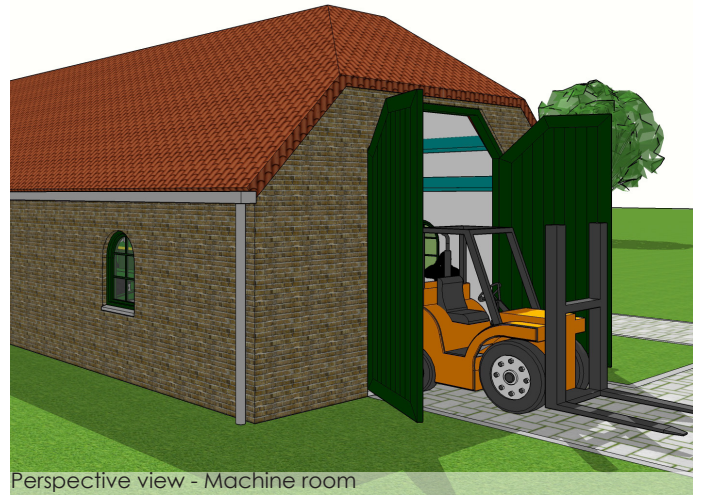
Perspective view - Machine room