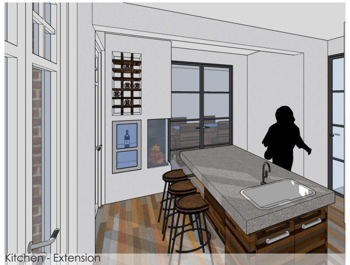
Kitchen - Extension