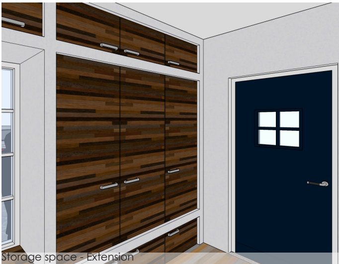
Storage space - Extension