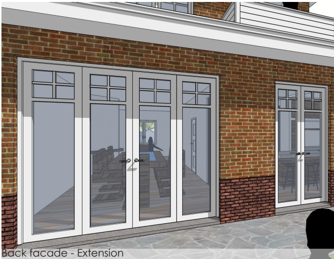
Back facade - Extension