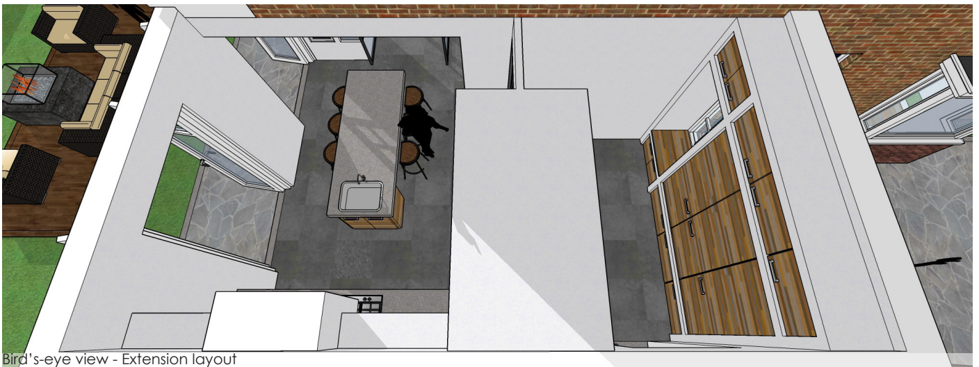
Bird's-eye view - Extension layout

Office address: Delfseplein 36 | unit 1.03 3013AA Rotterdam The Netherlands