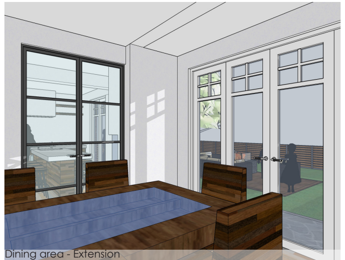
Dining area - Extension