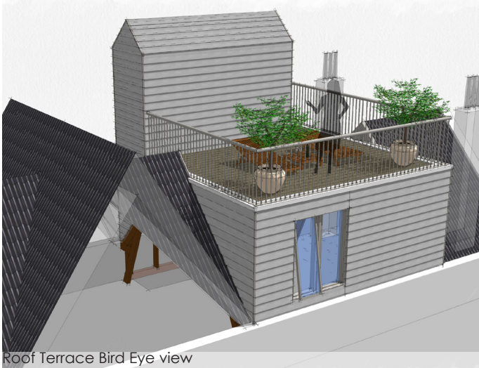
Roof Terrace Bird Eye view