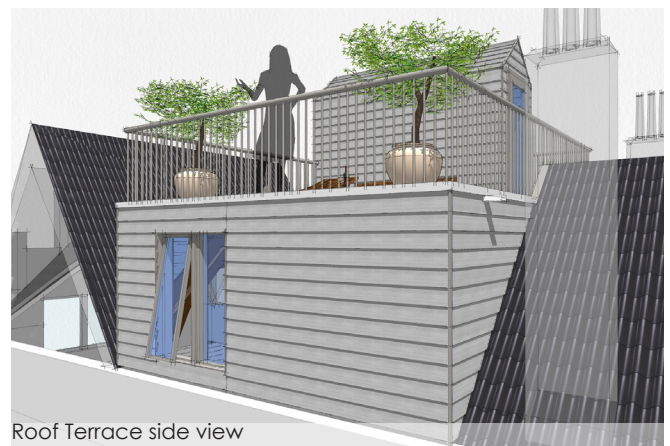
Roof Terrace side view

On the second floor, an old wooden 'extension' on the balcony (what used to be a shower) has been removed and a new luxurious bathroom has been realized in the attic. The roof of the house has been saved from collapse and the middle section has been raised to a platform with on top a quaint roof terrace.