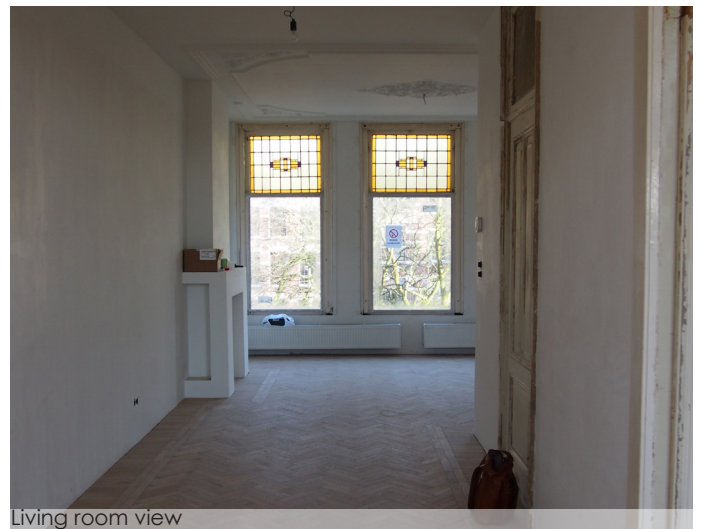
Living room view

Office address: Delfseplein 36 | unit 1.03 3013AA Rotterdam The Netherlands