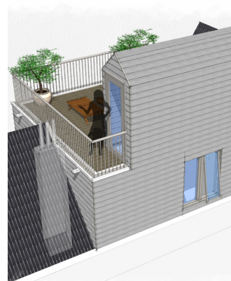
Roof Terrace Entrance view