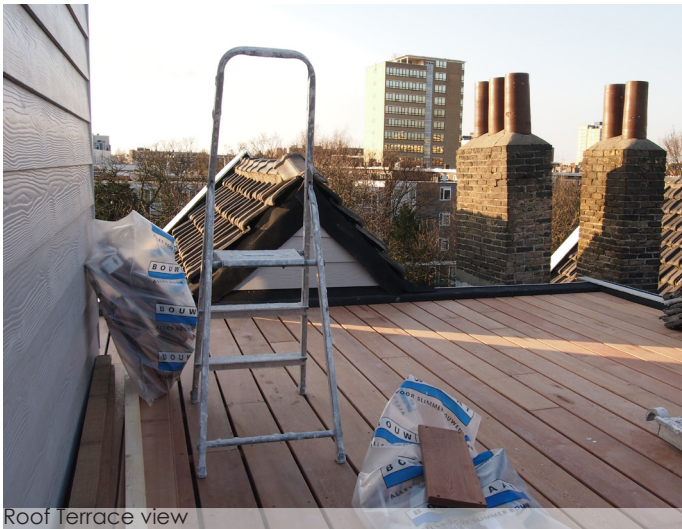
Roof Terrace view