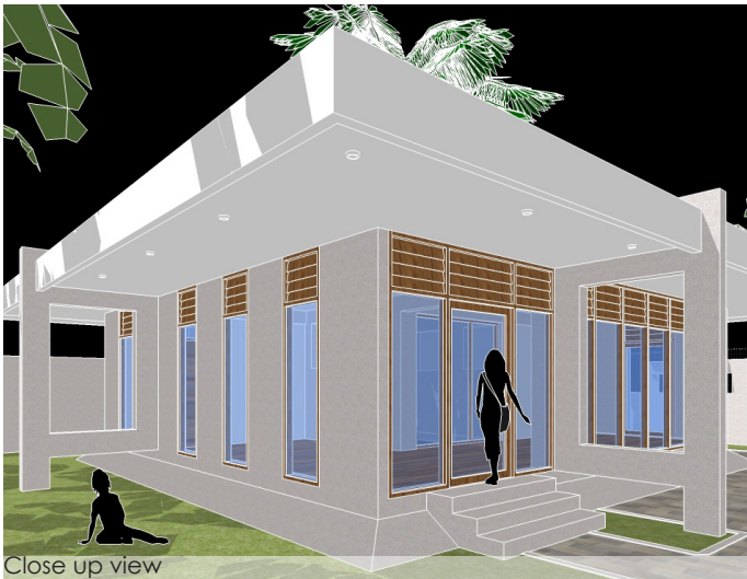
Close up view