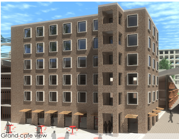
Grand cafe view