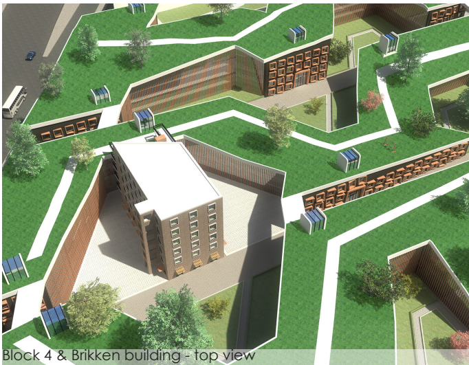
Block 4 & Brikken building - top view