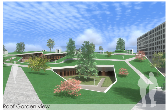
Roof Garden view

The buildings are shaped in an irregular pattern to make sure they do not become monotonous despite their length, and are shaped around courts designed for optimal sunlight conditions (from south-west or south-east) to as many dwellings as possible.