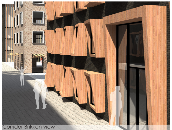
Corridor Brikken view

Office address: Delfseplein 36 | unit 1.03 3013AA Rotterdam The Netherlands